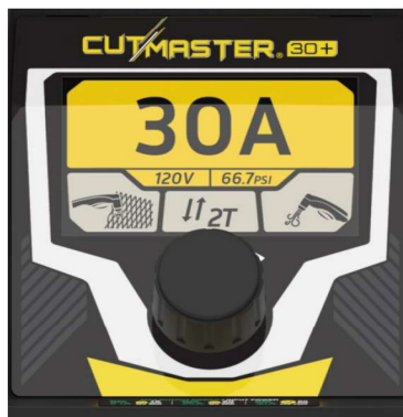
Simple and intuitive TFT LCD panel