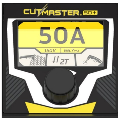
Simple and intuitive TFT LCD panel