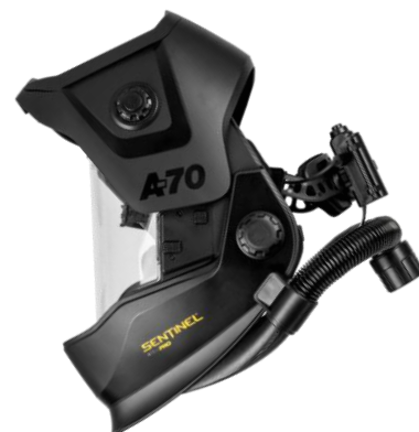
Sentinel A70 Air PRO